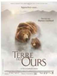
Terre des ours