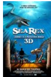
Sea Rex 3D: Journey to a Prehistoric World