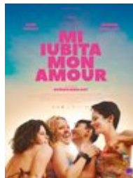
Mi iubita mon amour