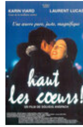
Haut les cœurs !