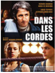
Dans les cordes