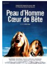
Peau d'homme, cœur de bête