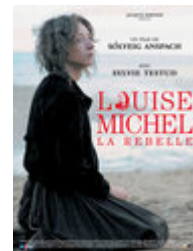
Louise Michel, la rebelle