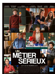
Un métier sérieux