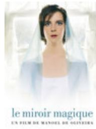
Le Miroir magique