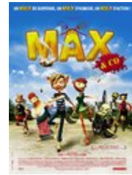
Max & Co.