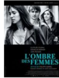
L'Ombre des femmes