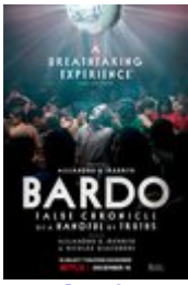
Bardo, fausse chronique de quelques vérités