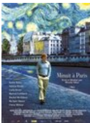
Minuit à Paris